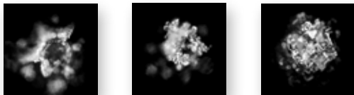
Samples of Un-Structured Water

Of course, no one is advocating for less water processing, or at least the minimum amount needed to make our drinking water clean and safe. We all want water which is safe, clean, and pure, not to mention convenient to access. But we also want water which is in its "natural" state, because that is what our bodies need.