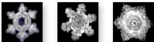
Samples of Structured Water*

* Water sample images courtesy of Natures Design Products GmbH, Sarnen, Switzerland.