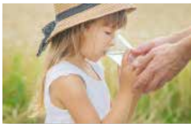
Our bodies are mostly water

When we take water from nature for our own uses, we process it using technology which has the effect of causing the water to lose its naturally-occurring hexagonal structure.